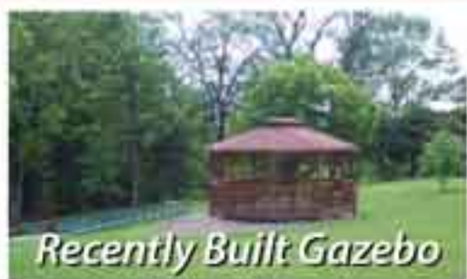
Recently Built Gazebo