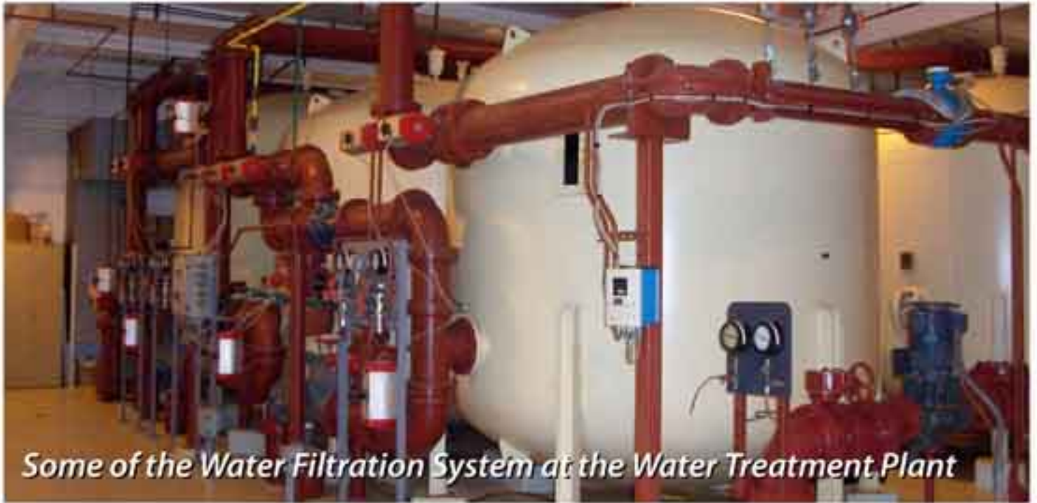
Some of the Water Filtration System at the Water Treatment Plant

The Village of Barnesville supplies water to a portion of four counties.