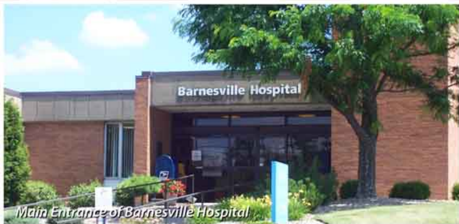
Main Entrance of Barnesville Hospital