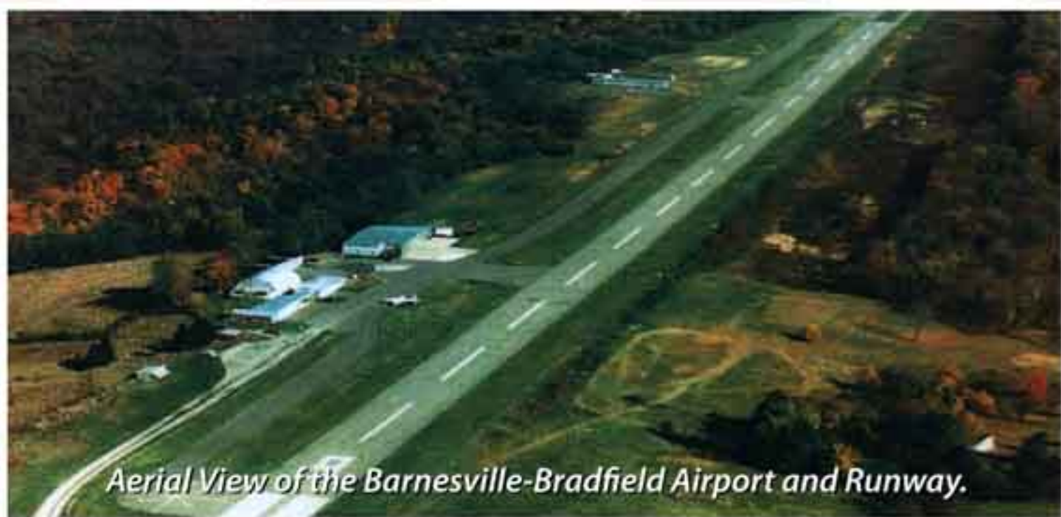
Aerial View of the Barnesville-Bradfield Airport and Runway.