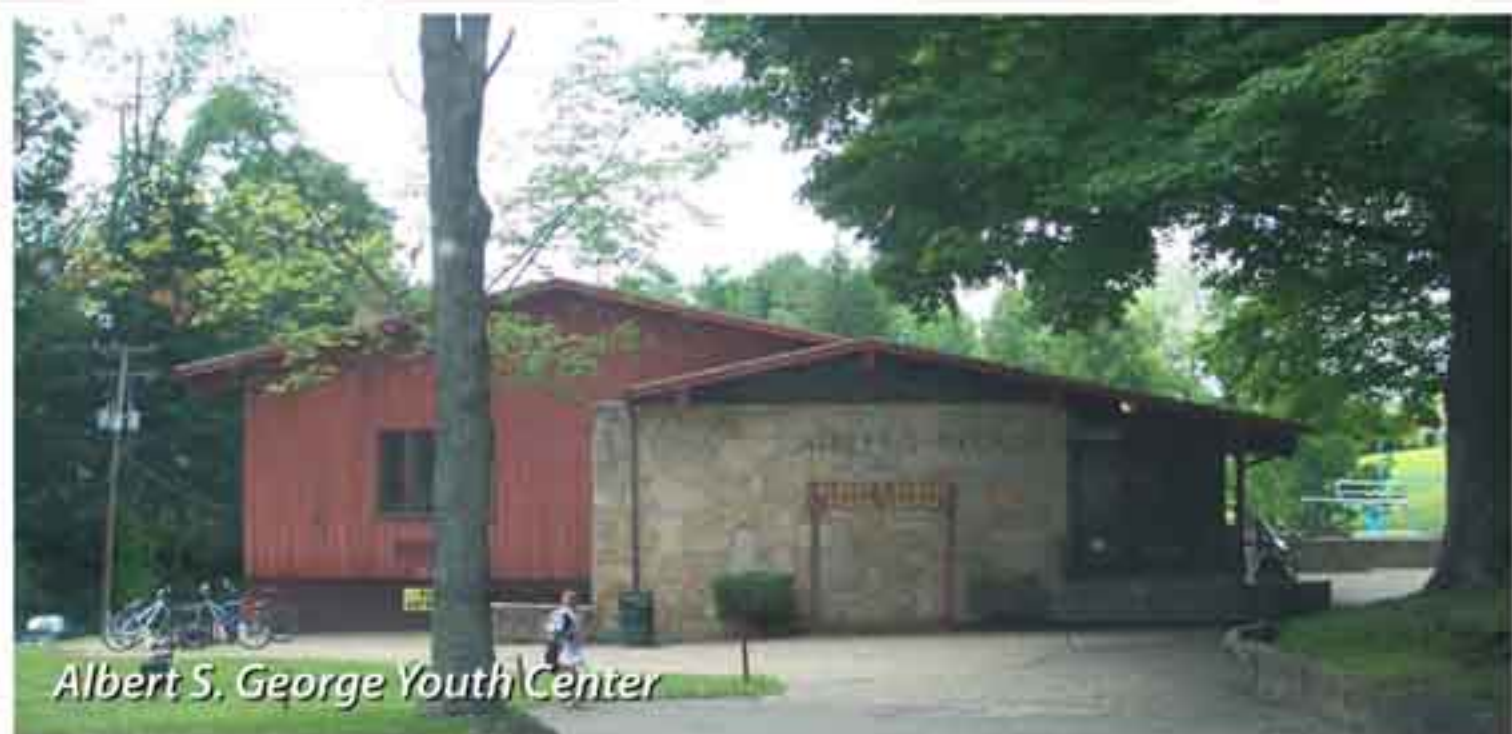
Albert S. George Youth Center