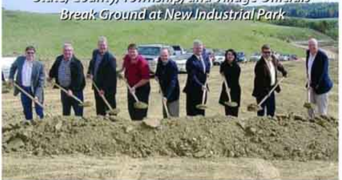
State, County, Township, and Village Officials Break Ground at New Industrial Park

Also in the area is the Barnesville-Bradfield Airport, Dickinson Cattle Company and soon, the Eastern Ohio Regional Industrial Park off of State Route 800 near Barnesville.