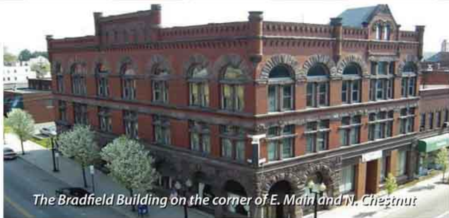
The Bradfield Building on the corner of E. Main and N. Chestnut