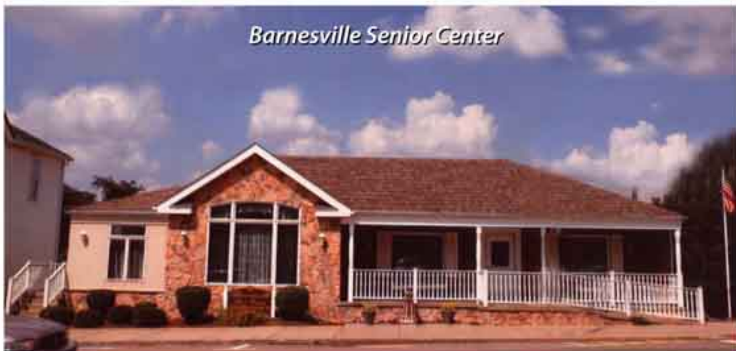
Barnesville Senior Center

Pictured above is the Barnesville Senior Center. The Senior Center is a place for Senior Citizens to get together and visit. Many events for all ages take place in this recently renovated center.