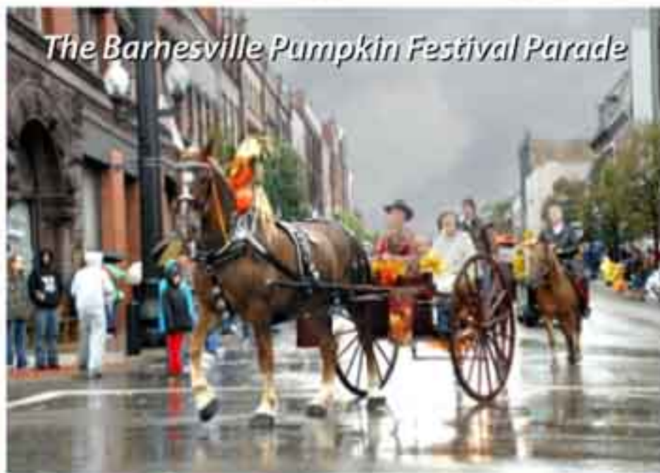
The Barnesville Pumpkin Festival Parade

Barnesville is a great place to visit or live, because of the friendly people and small town feel.