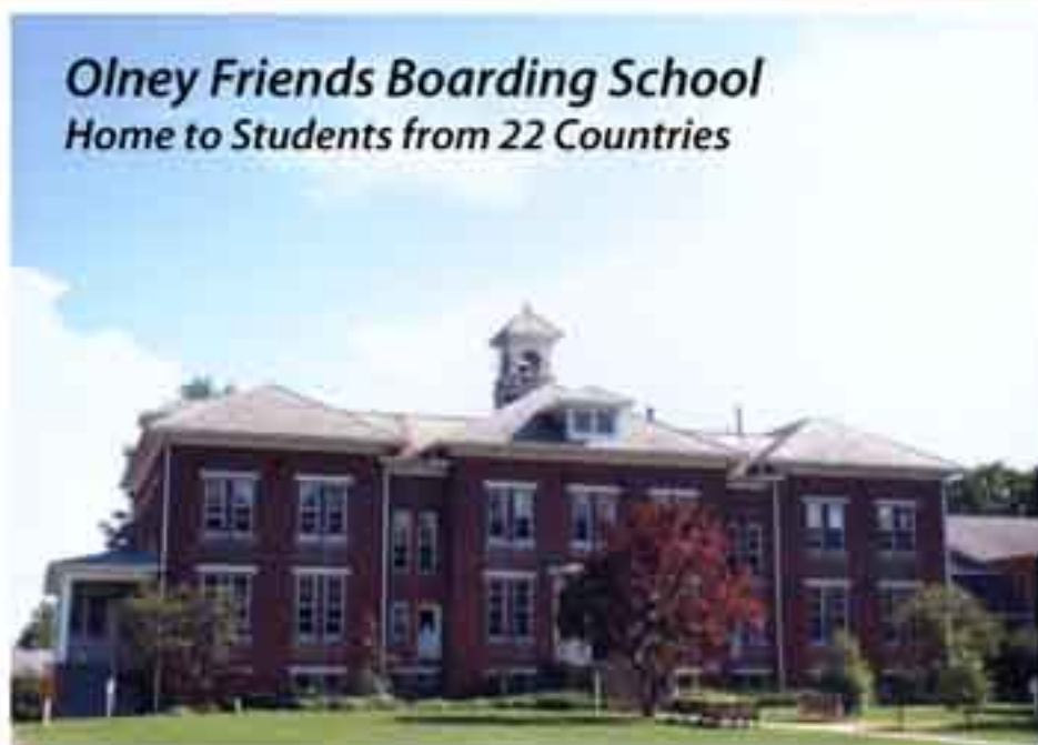
Olney Friends Boarding School Home to Students from 22 Countries