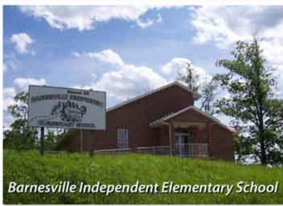
Barnesville Independent Elementary School