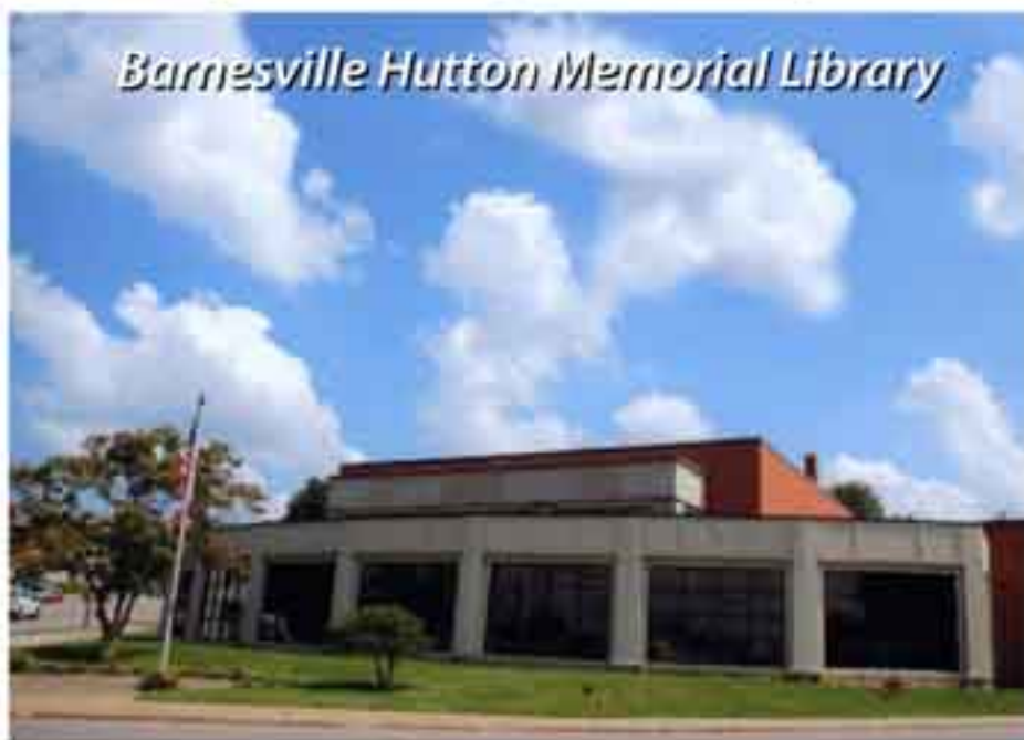
Barnesville Hutton Memorial Library

Pictured at right is the Barnesville Hutton Memorial Library. Many children's events take place here and is a great place to borrow books and movies, as well as research on their many computers.