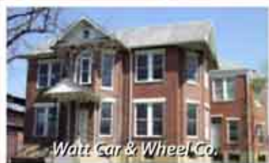
Watt Car & Wheel Co.