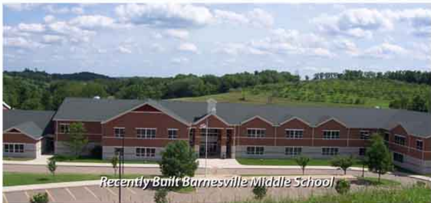
Recently Built Barnesville Middle School