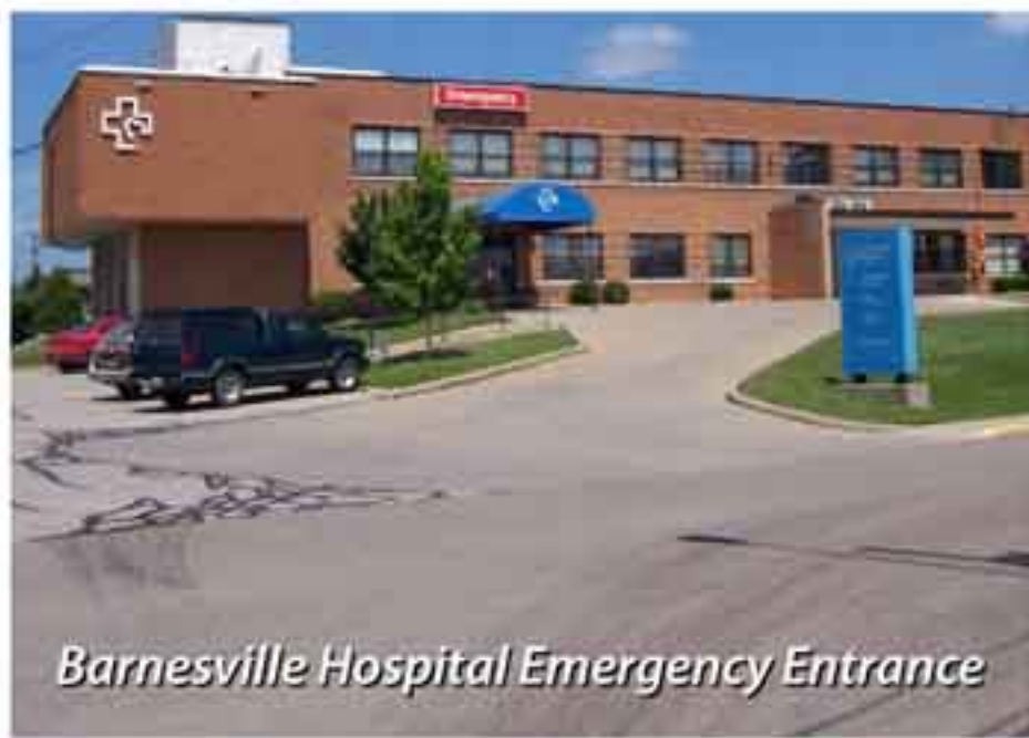
Barnesville Hospital Emergency Entrance

Barnesville is very fortunate to have a hospital within our small town. Barnesville Hospital provides and coordinates quality health services and health education, and offer compassionate, quality health care according to the physical, spiritual, psychological, social, religious, environmental, and economic needs of our communities.