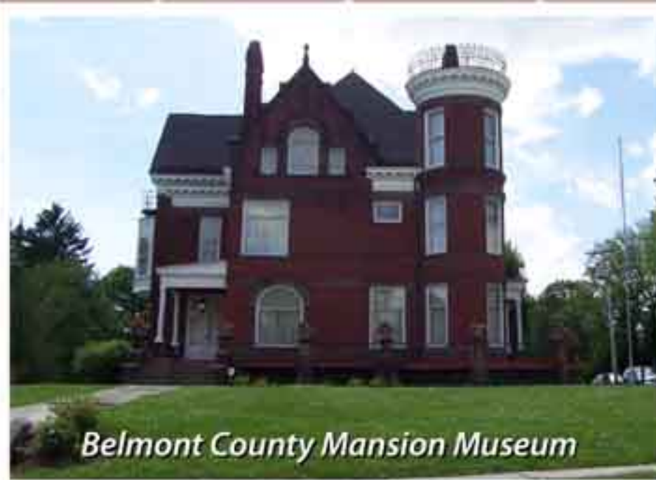
Belmont County Mansion Museum