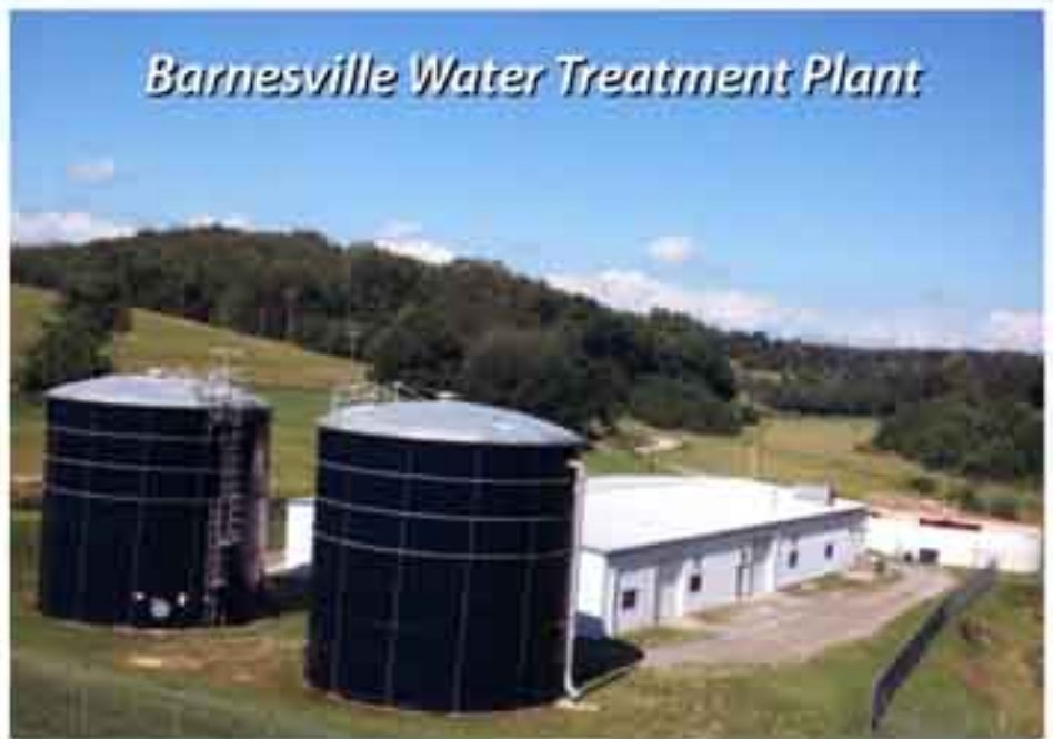
Barnesville Water Treatment Plant

The recently built water treatment plant can filter 2.5 million gallons per day.