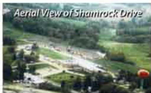
Aerial View of Shamrock Drive