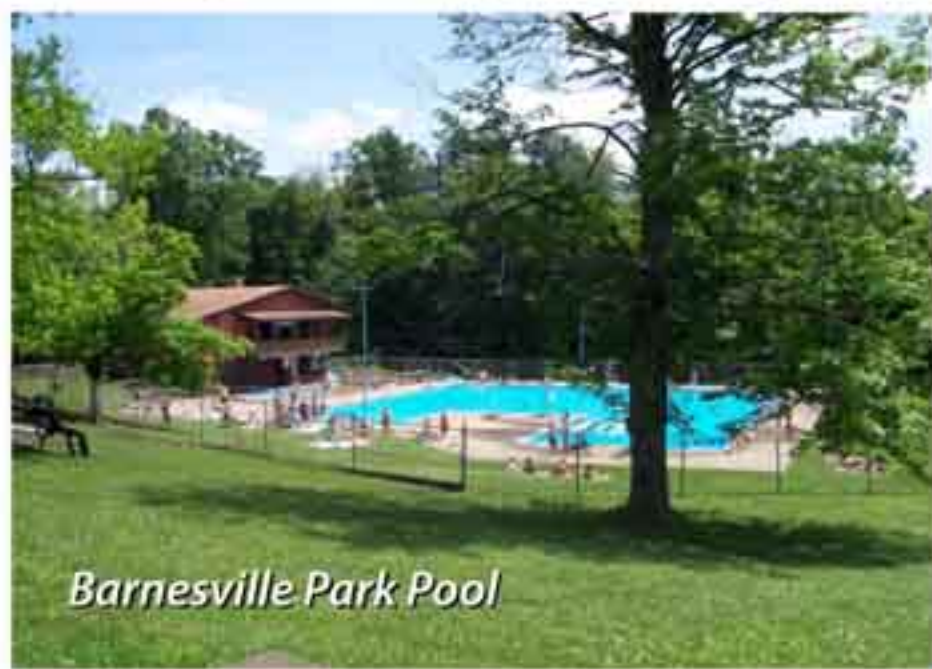
Barnesville Park Pool