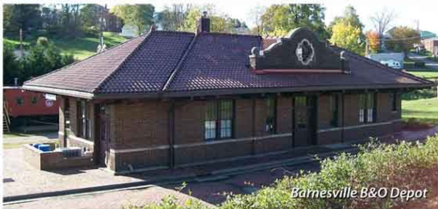
Barnesville B&O Depot